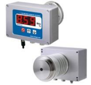
Option Refractometer (BRIX)