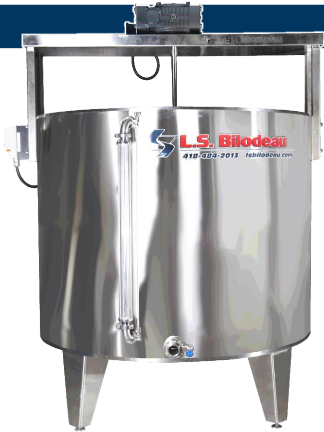
3 blade agitator anti-vortex principle